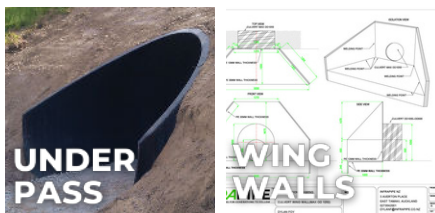
UNDER PASS WING WALLS