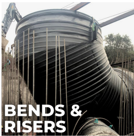
BENDS & RISERS