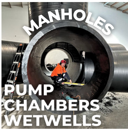
MANHOLES PUMP CHAMBERS WETWELLS