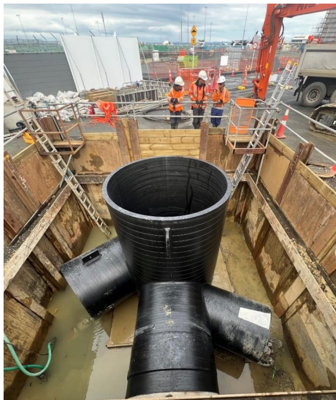
INFRAPIPE solid wall is used for manholes